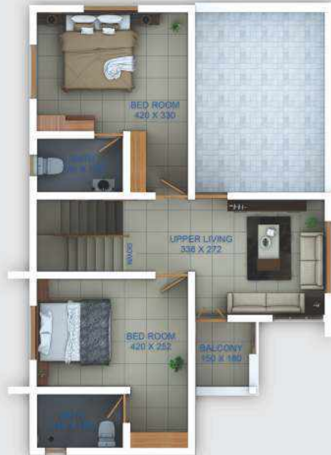
TYPE E | First Floor 752 Sqft.