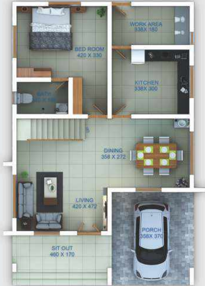
TYPE E | Ground Floor 1059 Sqft.