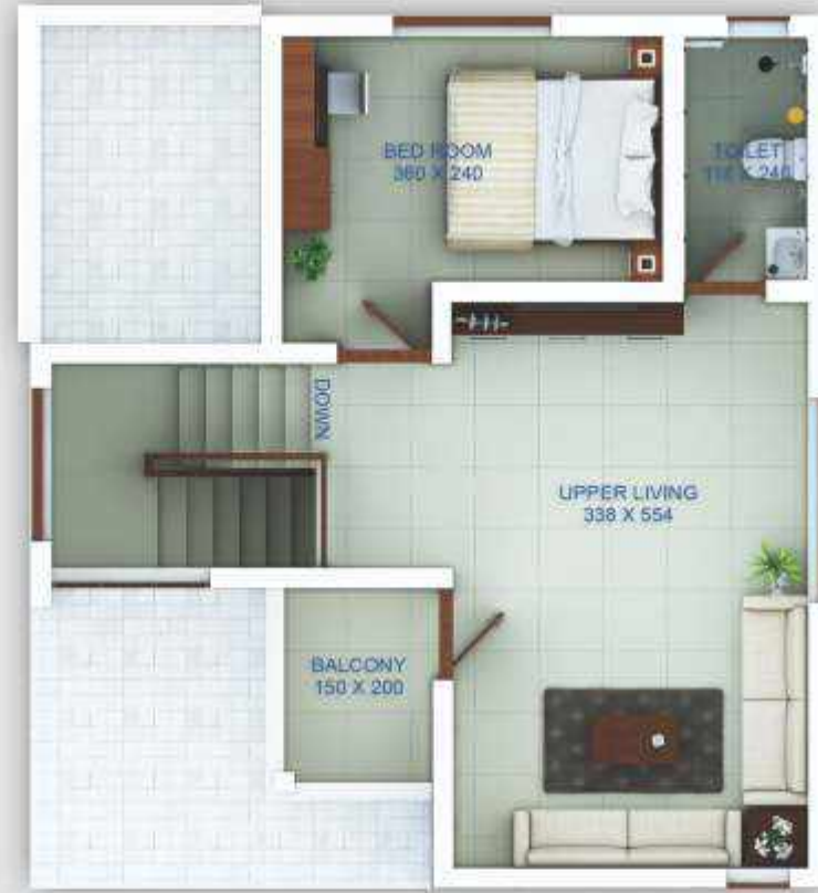
TYPE A | First Floor 532 Sqft.