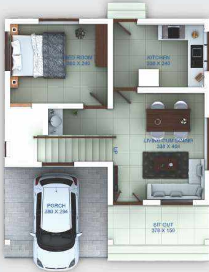
TYPE A | Ground Floor 697 Sqft.

The villas in Green View will provide you splendid experience. The interiors as well as the exteriors of the villas will be the finest in terms of convenience and structure.